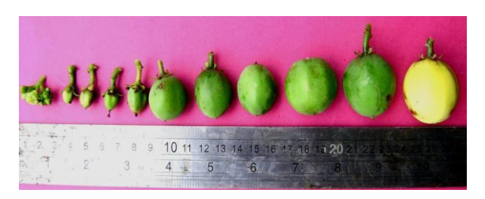
Fig. 2 : Jatropha fruits in different growth stages.